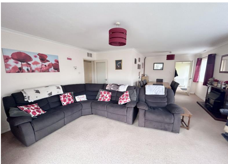
Address: 1 Elizabeth Gardens, Havenstreet, RYDE, PO33 4DU RRN: 9225-3034-3202-9504-8200

While every attempt has been made to ensure the accuracy of the floorplan contained here, measurements of doors, windows, rooms and any other items are approximate and no responsibility is taken for any error, omission or misstatement. This plan is for illustrative purposes only and should be used as a guide for any prospective purchaser. The services, systems and appliances shown here will be tested and no guarantee as to their operability or efficiency can be given. Made with Metropix ©2024